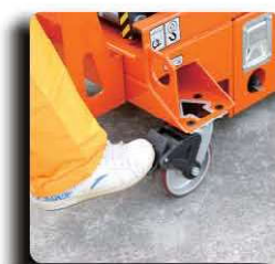
Castor With Brake