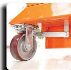
Automatic Brake System-Option