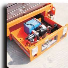
Slide Out Tray