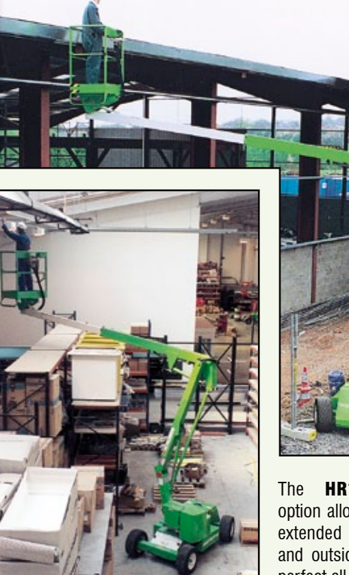
The HR12's Bi-Energy option allows it to work for extended periods inside and outside, making it the perfect all-rounder.

Due to a policy of continuing development and improvement, Niftylift reserves the right to change any specification without notice. Please confirm exact specification before ordering.